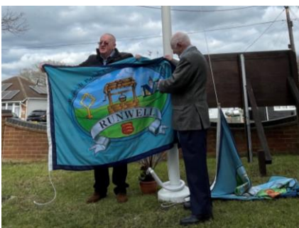
Unfurling the new flag