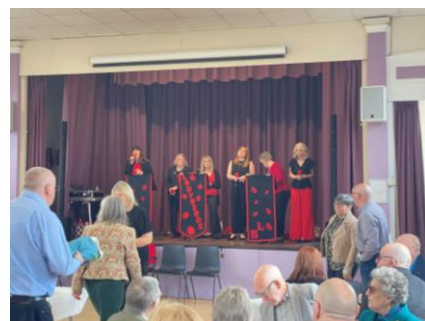
Thanks for the entertainment by the 'Ladybirds'